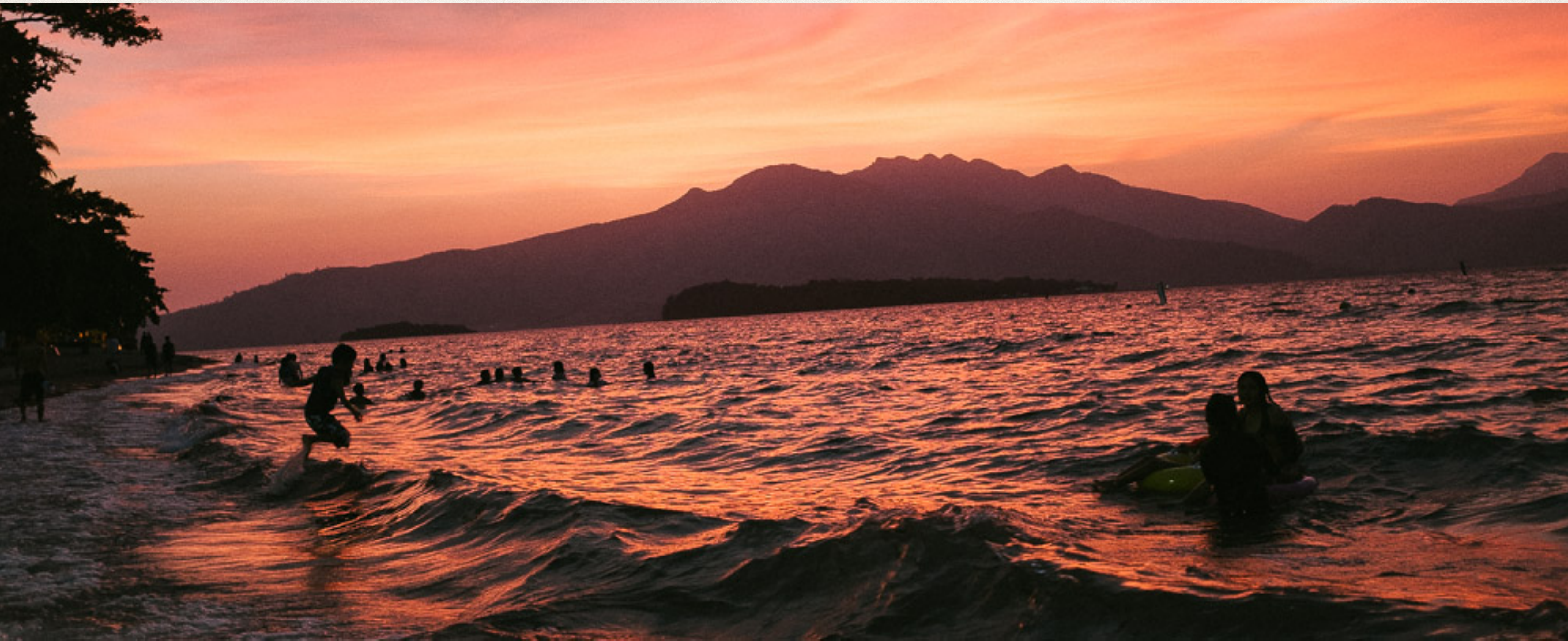
Subic, Philippines April 2013